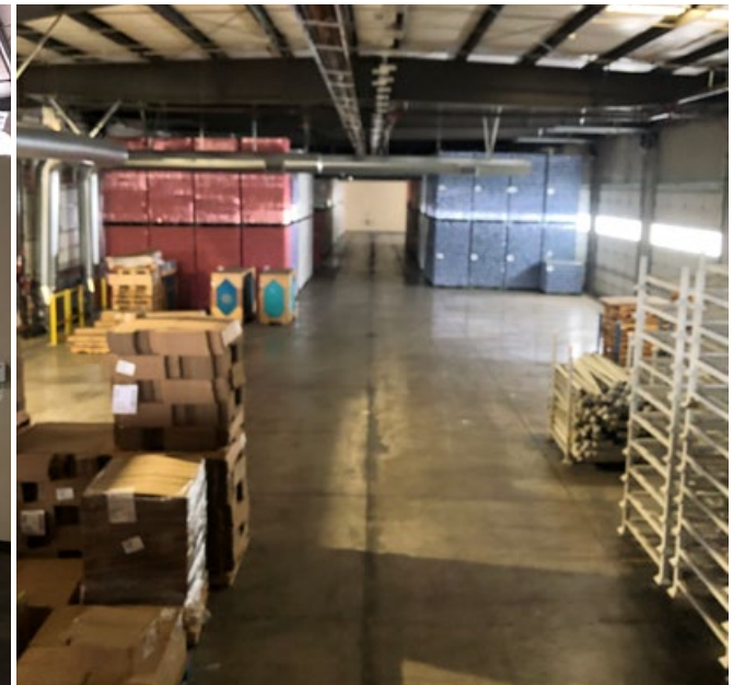
Warehouse from mezzanine