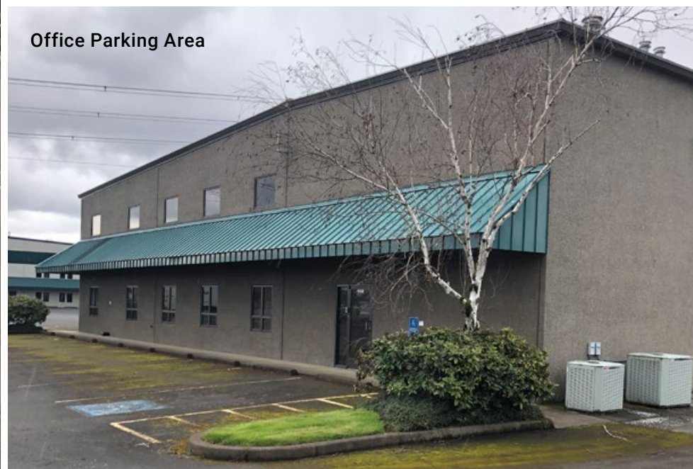
Office Parking Area