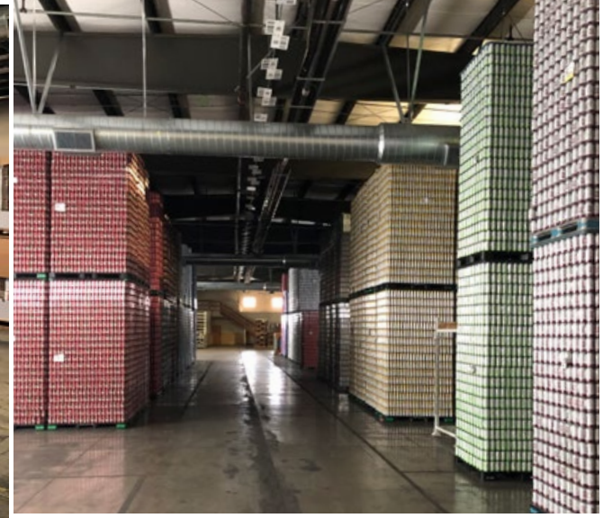
Typical Warehouse space