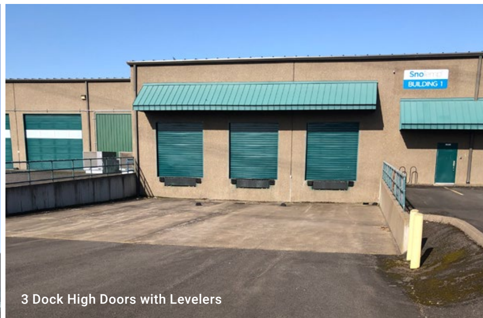
3 Dock High Doors with Levelers