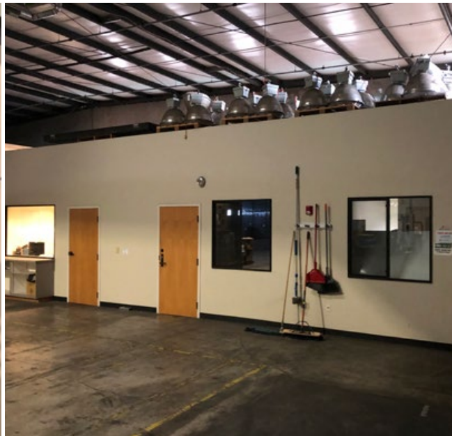
Office & Mezzanine area