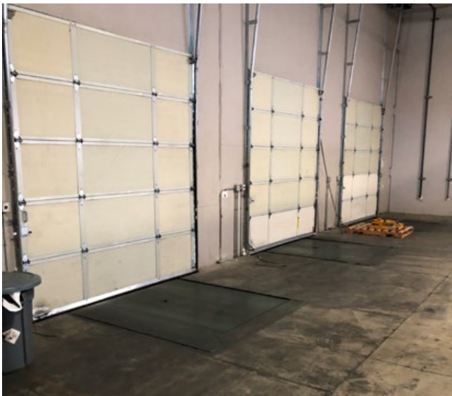
Dock Doors and Levelers